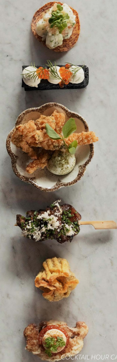
COCKTAIL HOUR CANAPÉS

Note our menu is seasonal and subject to change.