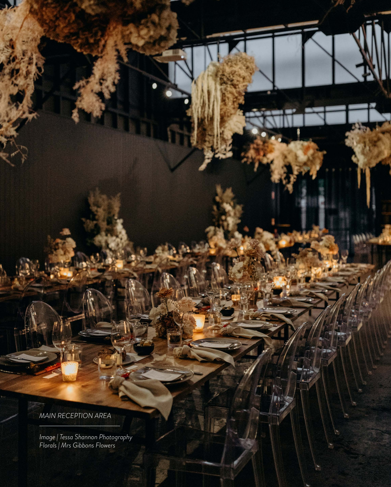
MAIN RECEPTION AREA

Florals | Mrs Gibbons Flowers