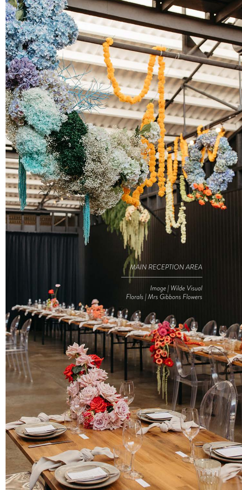
MAIN RECEPTION AREA

Note all drinks and vintages are subject to change.