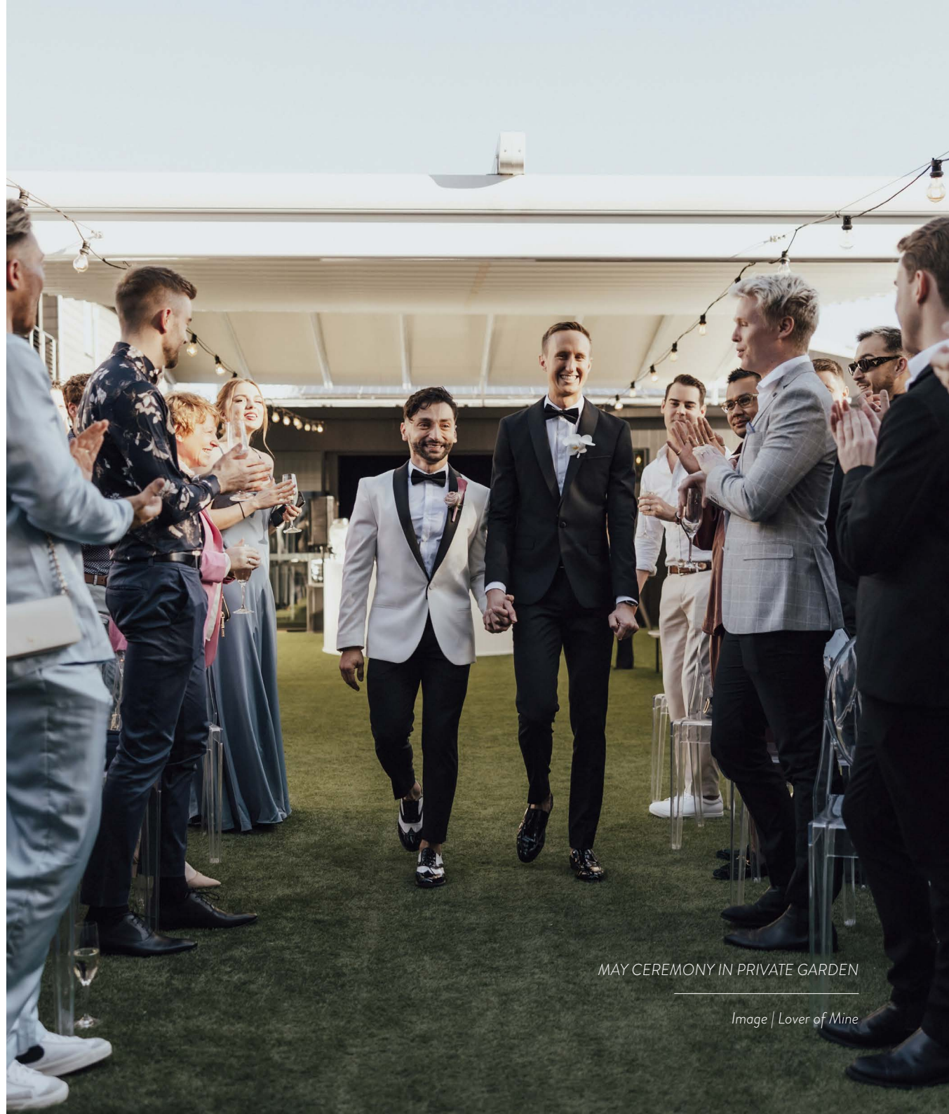
MAY CEREMONY IN PRIVATE GARDEN