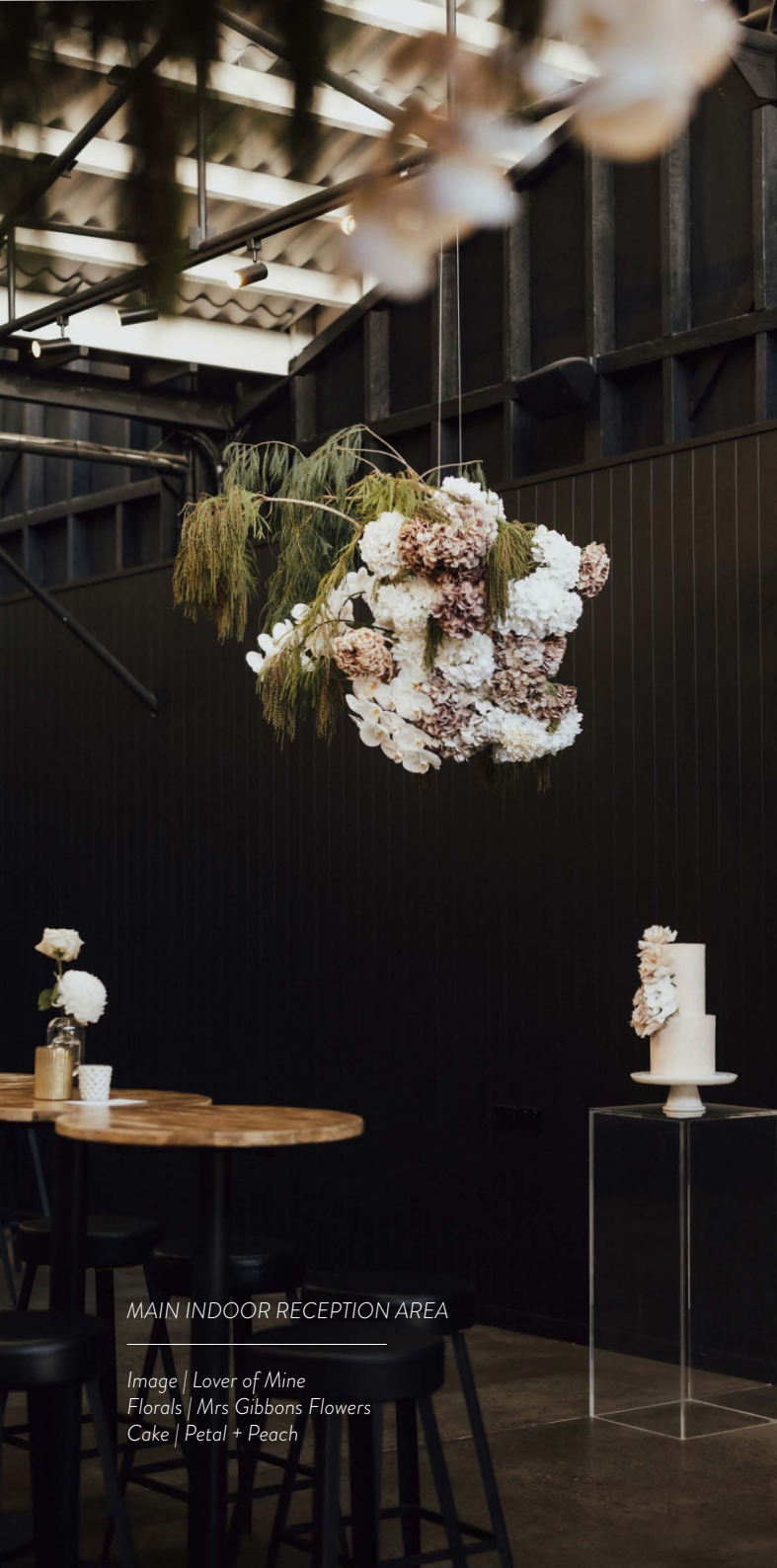
MAIN INDOOR RECEPTION AREA